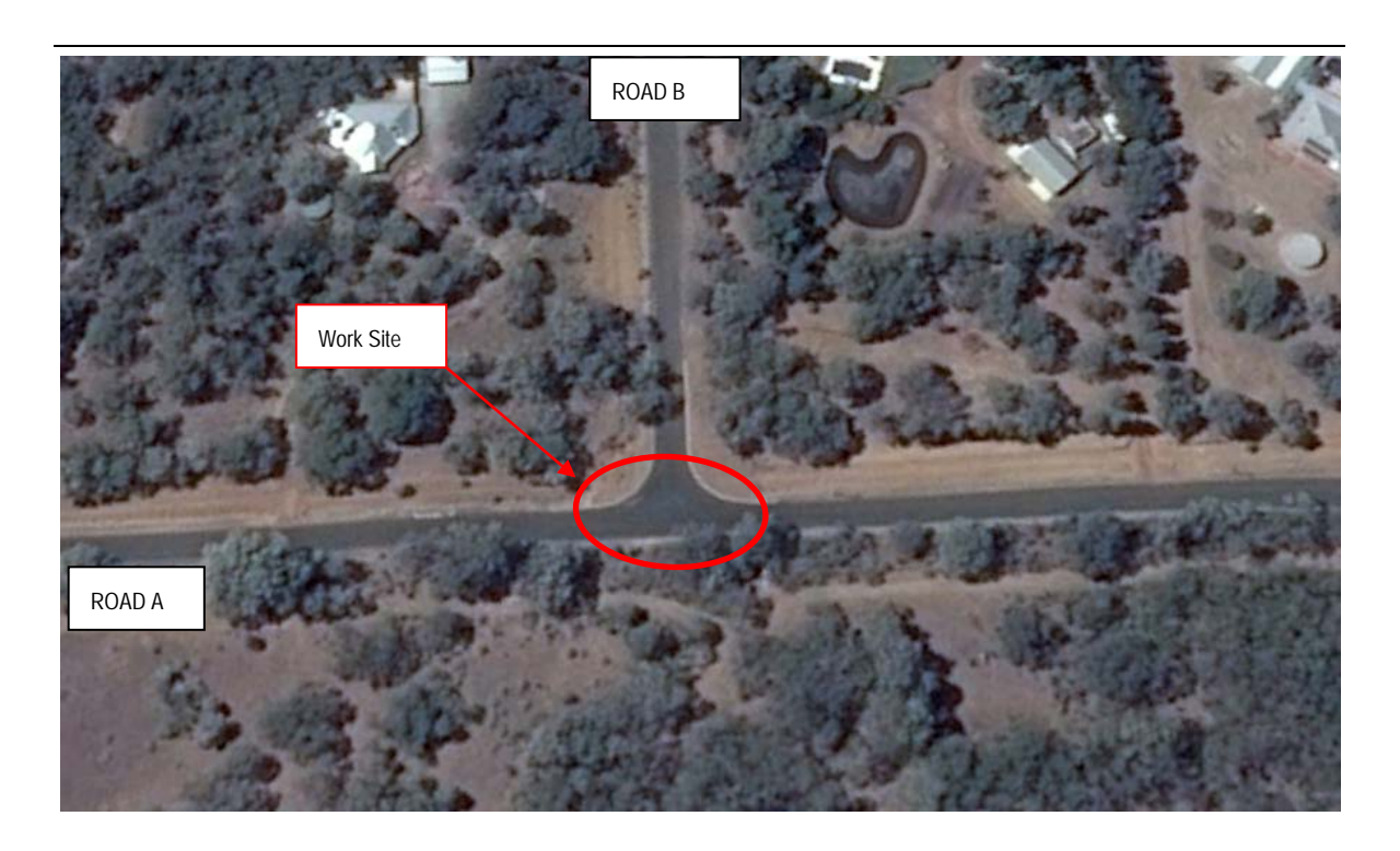
Figure 1 Site Location