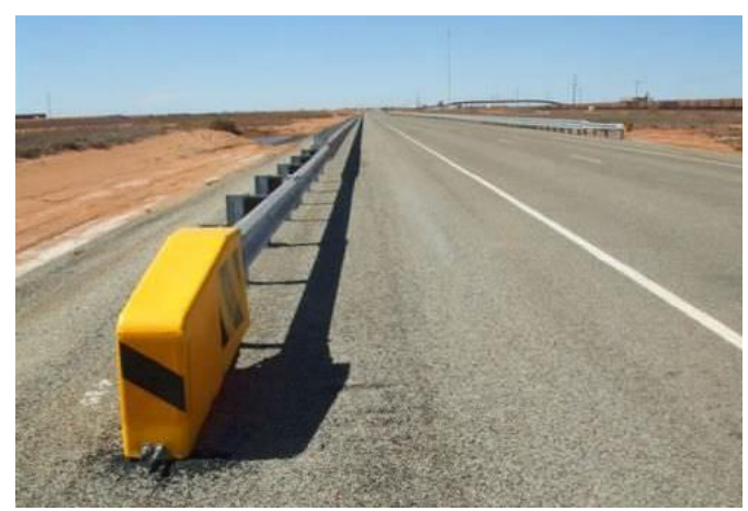
Note sticker is not to Main Roads WA requirements