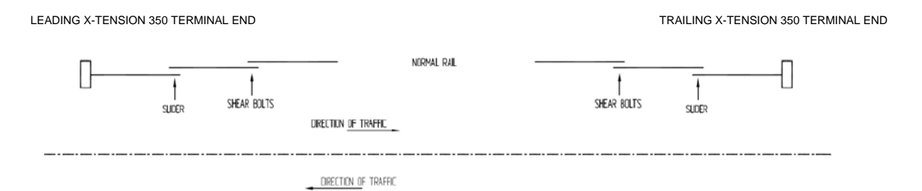
Sketch 1 - X-Tension 350 Departure End Terminal Layout