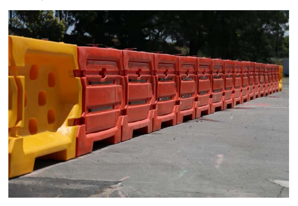
Figure 1: Photograph of Shield I Barrier and Terminal units