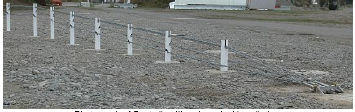
Photograph of Sentryline III end terminal installation.

Photograph of Sentryline II wire rope safety barrier installation.