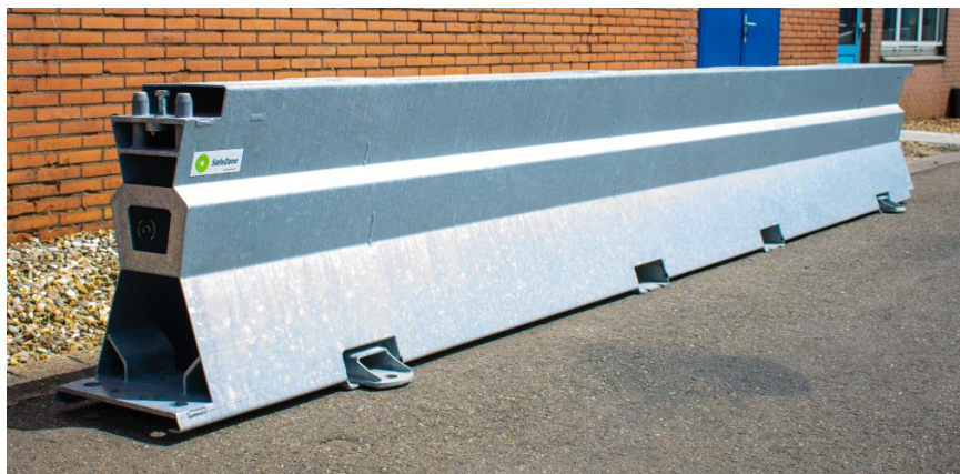
Photograph of 5.8m long element (2# anchor shoes shown)