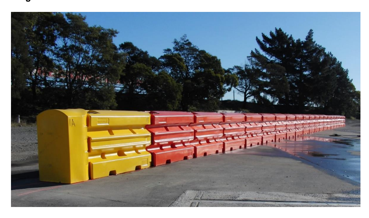
Figure 1: Photograph of Ricochet Barrier and Terminal units