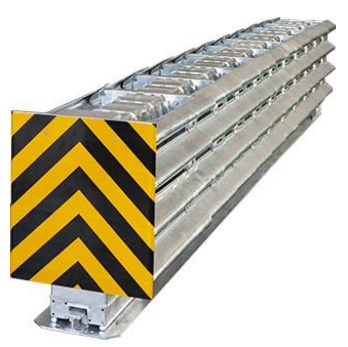
Photograph of Hercules Crash Cushion