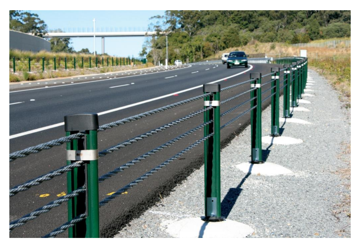
Photograph of installed Flexfence TL4 Wire Rope Safety Barrier

(refer to Supplier for post footing details)