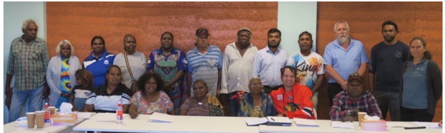
Tjurubalan Native Title PBC Directors with Main Roads staff.

It is planned to also form a Working Group with representatives from employment and training organisations, to promote Aboriginal engagement in project delivery and assist Main Roads in achieving Aboriginal participation targets.