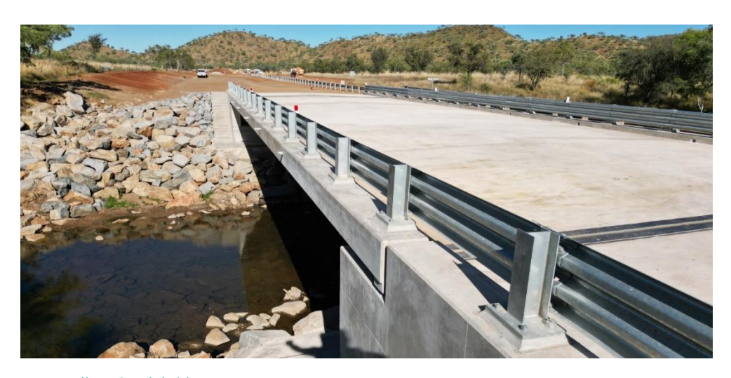
Frog Hollow Creek bridge

For further information on the project, subscribe to updates at <a href="https://www.mainroads.wa.gov.au/gnh-bridges/">https://www.mainroads.wa.gov.au/gnh-bridges/</a> or contact Main Roads on enquiries@mainroads.wa.fov.au and 138 138.