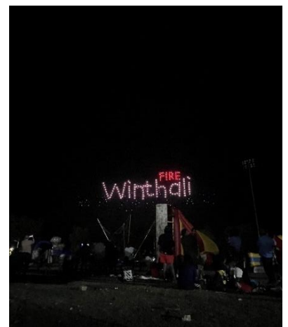
Above: Dreamtime Drone show at Stronger Together Festival.

In early October, the Valley celebrated the community's resilience following the floods through the Stronger Together Festival. Together with the Shire, the project hosted an opening event with impacted residents and helped build a drone launch pad to facilitate a dreamtime light show.