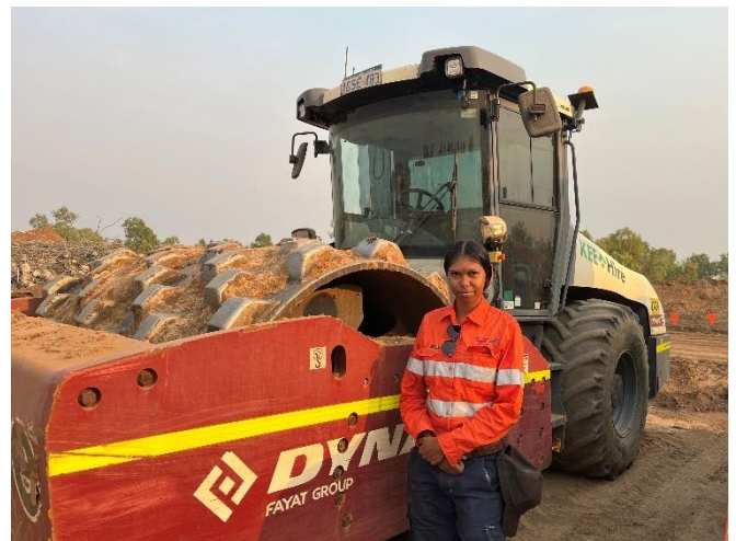
Above: Natarlia operating a roller after completing training and obtaining national competency.