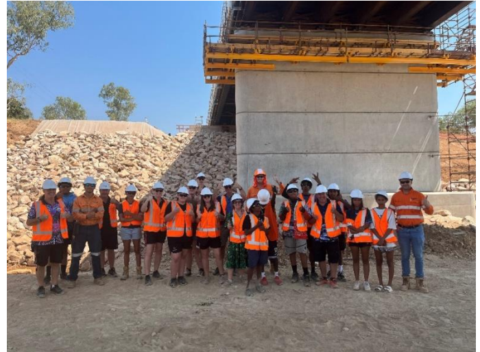
Above: Fitzroy Valley DHS standing under the bridge.

Remote community schools are also invited to take part in visits to explore the bridge site and learn more about the project's construction.