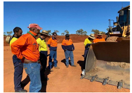
Shire's trainees - on-site learning at gravel pit.

In 2020, eight Halls Creek locals completed a Certificate III in Civil Construction and of these, 7 are now working for the Shire of Halls Creek. In March this year, eight locals enrolled into the Certificate III with two participants already securing work. It is expected another five participants to graduate in the coming weeks.