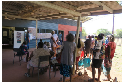
Yaruman community information session, July 2021.

Presentation material included maps, details of completed works to-date and planned works for the completion of the project.