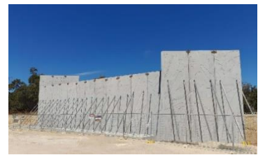
MSE walls at the Bussell-Highway Y-interchange