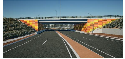
Visualisation of the Birak-themed art design

The art design reflects the Noongar season of Birak, represented with red, burnt orange and brown toned colours to capture the aesthetic essence of the first summer.