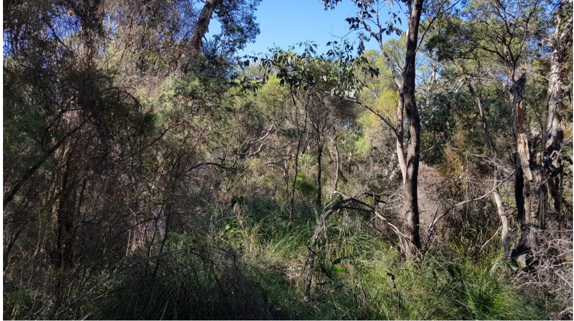
Figure 3 Potential habitat searched on Lot 160