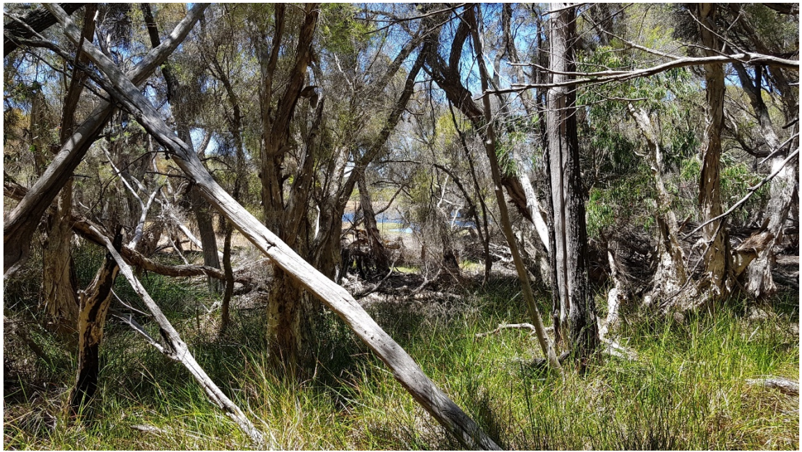
Figure 4 Potential habitat searched on Lot 101