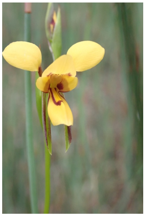
Figure 1. Diuris drummondii photographed during an Ecoedge survey in Capel, 2018.

Diuris drummondii is listed as Vulnerable under both the State Biodiversity Conservation Act 2016 and the Commonwealth Environment Protection and Biodiversity Conservation Act 1999. D. drummondii is found in low-lying depressions in peaty and sandy clay swamps (DEWHA, 2008). The optimum survey time for the orchid is from November to January when the tall (up to 1 m high) yellow-flowering orchid is in bloom Figure 1.