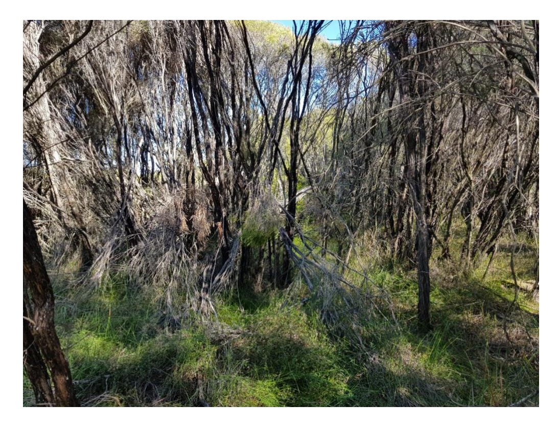
Figure 2. Photograph of the wetland where it extends into Lot 160.