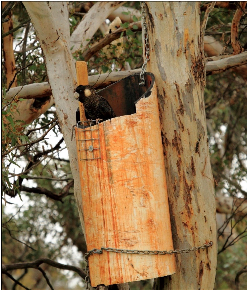
Carnaby's cockatoo female prospecting an artificial hollow.