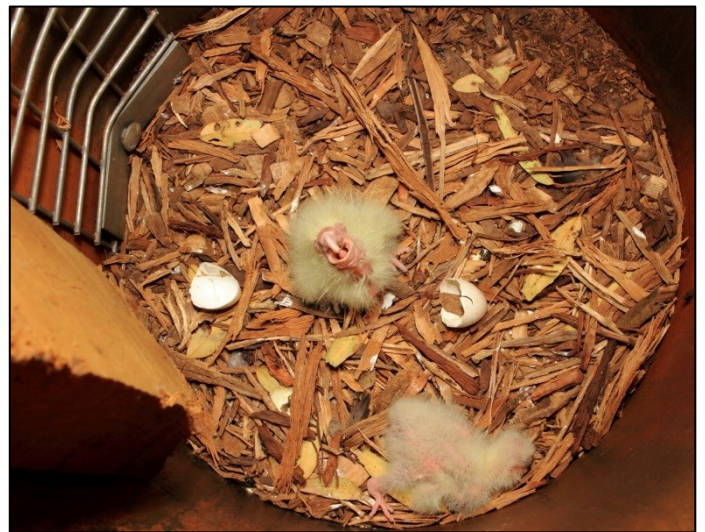
Bottom of an artificial hollow showing ladder that is fixed to the wall and a chewed sacrificial post which is 200 mm from the floor.

It is recommended that at least two posts are provided. Posts 70 x 50 mm have been used, but require replacing at least every second breeding season when the nest is active. Birds do vary in their chewing habits and therefore the frequency at which the chewing posts require replacement will also vary.