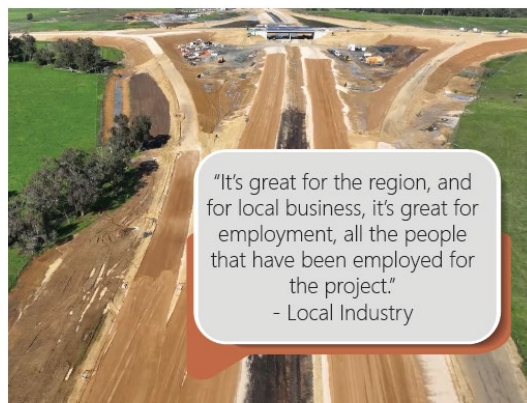
Raymond Road interchange

Alternatively, you can contact 138 138 or email enquiries@mainroads.wa.gov.au .