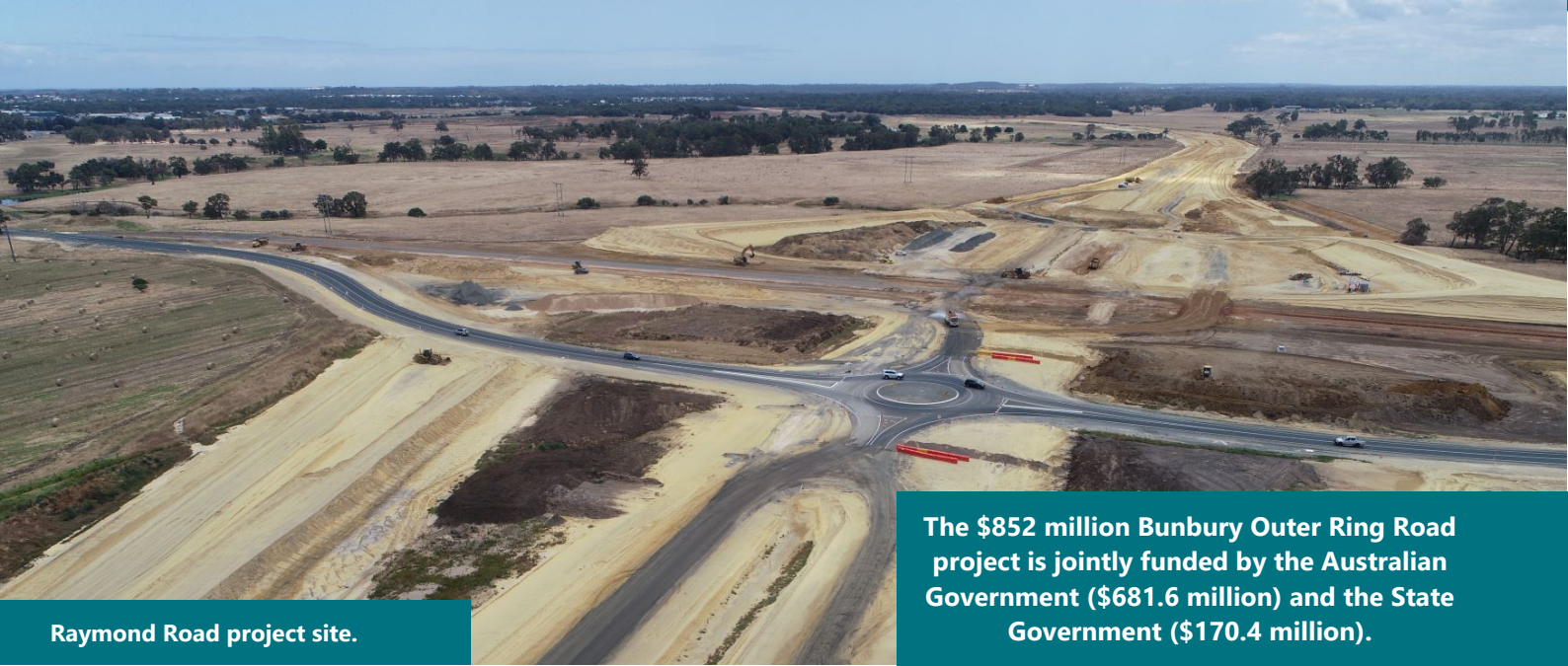
Raymond Road project site.

The $852 million Bunbury Outer Ring Road project is jointly funded by the Australian Government ($681.6 million) and the State Government ($170.4 million).