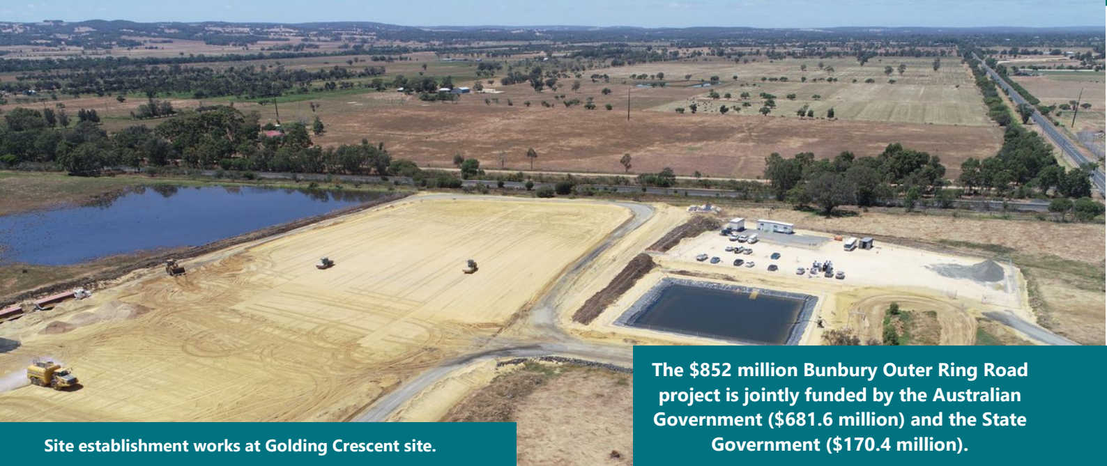
Site establishment works at Golding Crescent site.

The $852 million Bunbury Outer Ring Road project is jointly funded by the Australian Government ($681.6 million) and the State Government ($170.4 million).