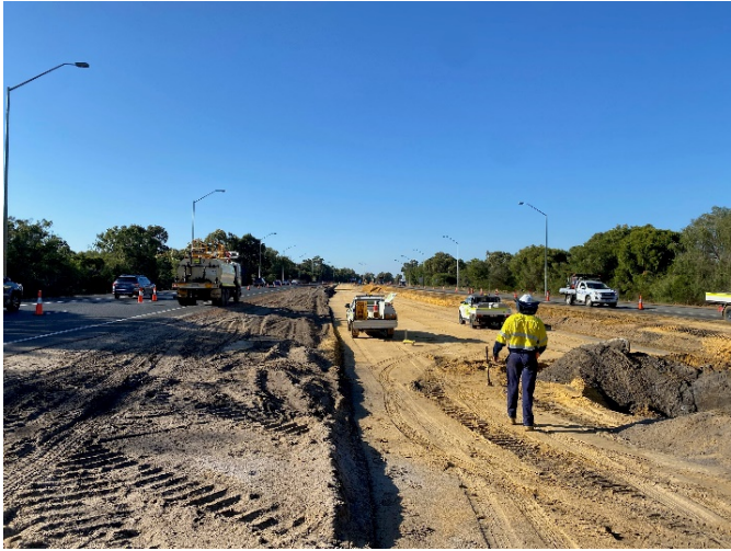
Forrest Highway median works