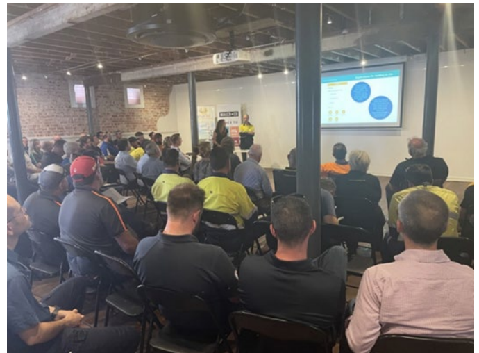
Business briefing in Bunbury

This session will have capped numbers due to the current COVID-19 restrictions. Masks are required and all attendees are required to provide proof of vaccination.