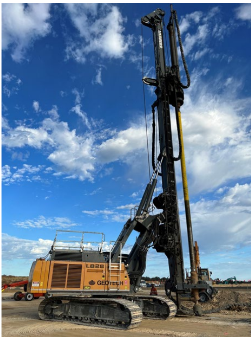
Drill rig at the Raymond Road site

The large drill is fitted with a custom drilling tool that penetrates the ground, displacing the surrounding soil within the hole. Displacing the soil within the hole and not removing it (like a standard pile) strengthens the area where the columns are being constructed. Once the holes are dug, high-flow concrete is then pumped through the drill and used to fill the concrete column.