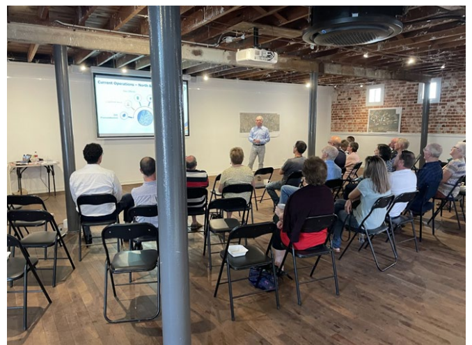
Central and South community meeting at Maker + Co.

If you would like to contact the project team, call us on 138 138 or email enquiries@mainroads.wa.gov.au .