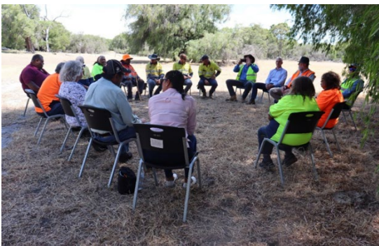
Aboriginal Heritage Advisory Group meeting with SWGA

Shortly afterwards, the AHAG met with the SWGA to review the Aboriginal Heritage Management Plan.