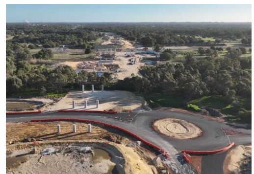
Work conducted on the Mega-Bridge at Golding Crescent