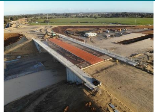
The Raymond Road Interchange

From a social outcome perspective, the project continues to work towards exceeding the local and Aboriginal business spend targets with commitments over the $450m local business and $30m Aboriginal business targets.