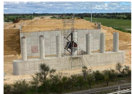
Columns at the Railway Road bridge