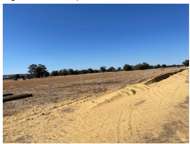
Fencing installation at the South West Highway project site

We've also completed several kilometres of agricultural fencing, and we will continue to move through the alignment as fast as possible.