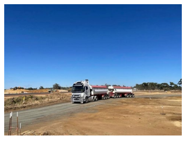
Fill delivery at South Western Highway

We have now imported more than two million tonnes of sand to project sites out of a required eight million tonnes - so there is still a fair way to go.