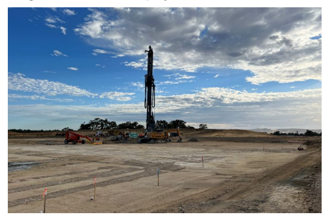
Drill rig at Raymond Road site

Piling will continue to ramp up as we prepare for more bridge works across our project sites.