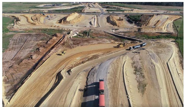
Drone shot at the Raymond Road project site

Finally, at the Boyanup/Picton project site, we have established our stockpile area and started topsoil stripping for future bridge works in the area.