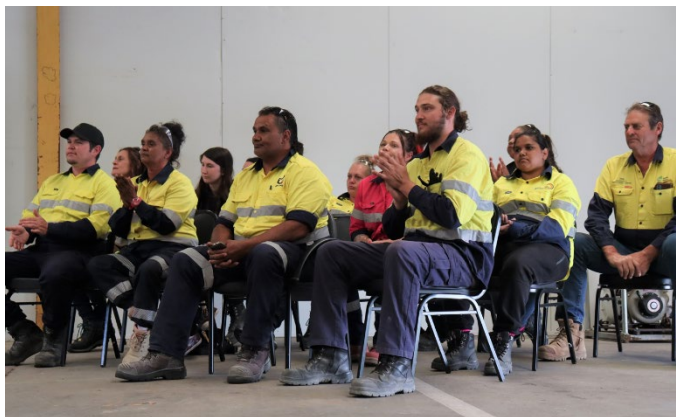
Yaka Dandjoo students at graduation

The Alliance is committed to at least 10 per cent of construction work hours being undertaken by Aboriginal people. We are also aiming to provide opportunities for the currently unemployed, intending to hire and train 10 per cent of the workforce, including prison release participants, providing them with lifelong skills.