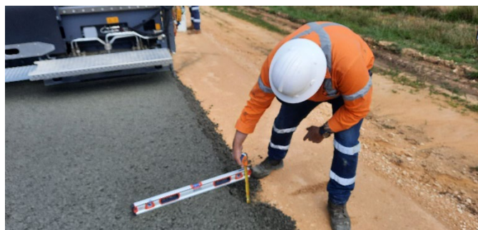
Team member reviewing the base course thickness

We are reviewing and testing the quality of the base course over the coming weeks.