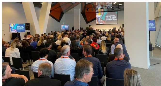
Meet the Buyer and Supplier Forum

With spend targets of $20m with Aboriginal businesses and $300m with local businesses, the forum was a great opportunity to network with key suppliers about opportunities on the project.