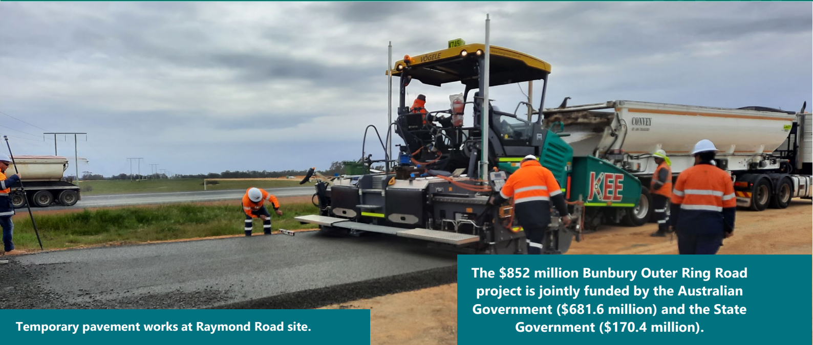
Temporary pavement works at Raymond Road site.

The $852 million Bunbury Outer Ring Road project is jointly funded by the Australian Government ($681.6 million) and the State Government ($170.4 million).