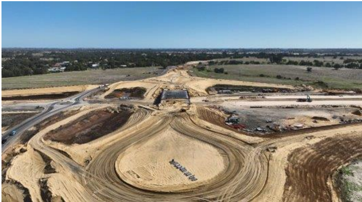
Activities onsite at the Raymond Road interchange

The Bunbury Outer Ring Road (BORR) is tracking at over 45 per cent completion, and with the arrival of colder and wetter weather, work has shifted to prioritise preparing the construction sites for these winter conditions.