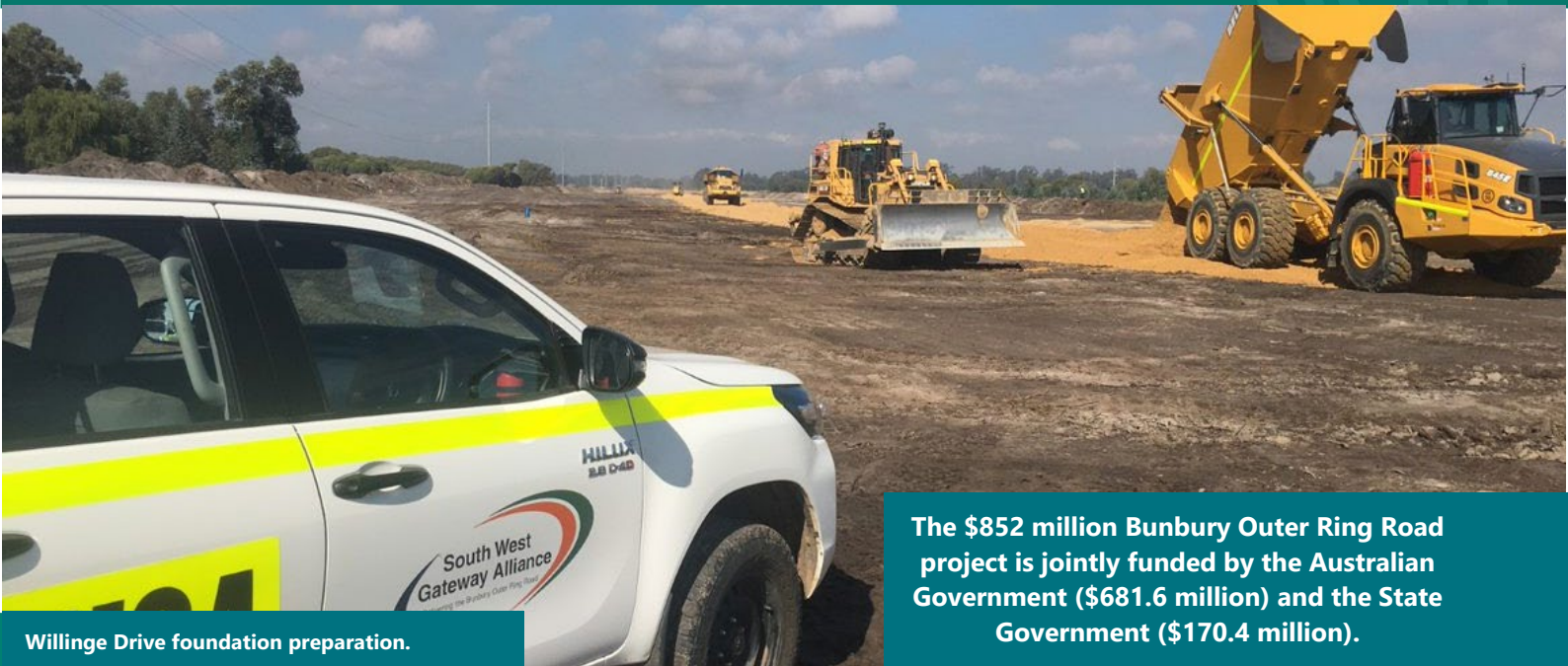
Willinge Drive foundation preparation.

The $852 million Bunbury Outer Ring Road project is jointly funded by the Australian Government ($681.6 million) and the State Government ($170.4 million).