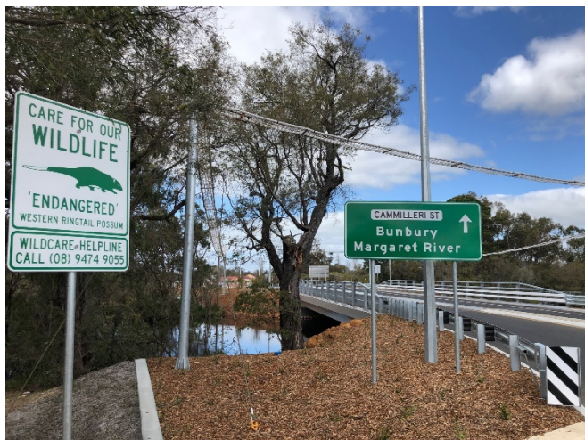
An example of a typical fauna rope bridge crossing, as installed by the City of Busselton.

Other projects such as Treendale Bridge, have seen great uptake of fauna bridges after installation and we are pleased to be installing these crossings along the newly constructed sections of BORR.