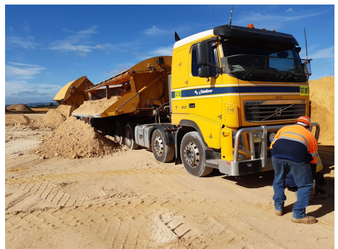
Limestone delivery at Raymond Road project site

We have also commenced some planning for road diversion works at both Raymond Road and Willinge Drive to support future construction in the area. Current works will not impact traffic, and more information on when these diversions will be in place will be shared soon.