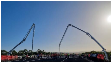
Deck work underway at the Boyanup-Picton Road bridge

abutments at the Yalinda Drive overpass has been completed, as well as the deck slab. Over at the Bussell Highway Y-interchange , rear-wall abutment concrete pouring is finished and preparation for beam landing at the central piers is underway.