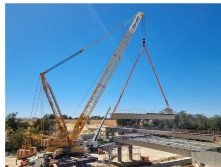
Construction in progress at the Collie River bridges

There has been progress across several of the bridges’ abutments in the southern section of the project with wall pouring completed on one of the two abutments at the Five Mile Brook bridge . Pouring of the skirt beams (which are the walls retaining the abutment embankments perpendicular to the bridge) on both