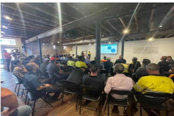
Business briefing at Maker + Co.

You can register your business now by clicking here or go to the project website homepage to register at: www.mainroads.wa.gov.au/BORR .