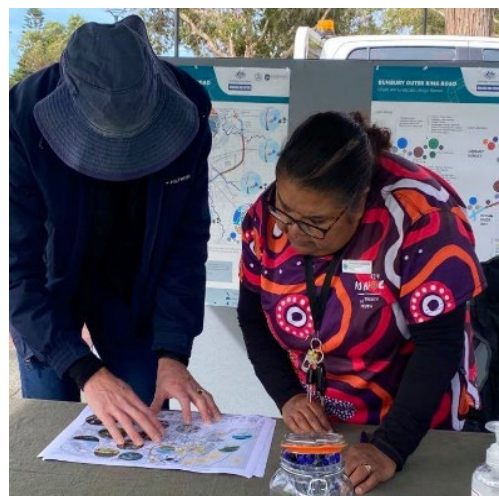
Reconciliation Bridge Walk consultation

For the next phase of consultation, we would like to share our concepts with the wider South West Community. Soon, we will be releasing a community survey to get your feedback on the Urban Design and Landscaping themes on BORR.