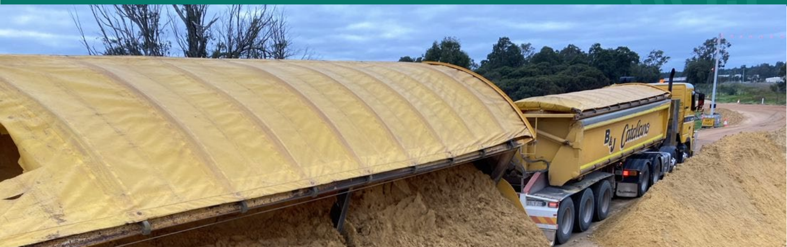
Truck delivering fill at the Willinge Dr project site.

The $852 million Bunbury Outer Ring Road project is jointly funded by the Australian Government ($681.6 million) and the State Government ($170.4 million).