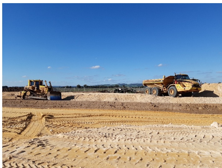
Works at Raymond Road Interchange

We are currently constructing a diversion road at Raymond Road to enable the interchange construction. We will be in touch before traffic switches take place to notify road users in the area.