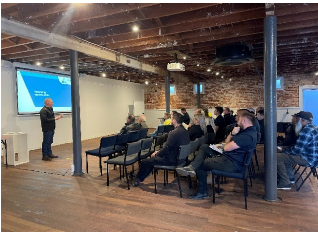
Business briefing at Maker + Co.

On 15 June, we held our latest round of Business Briefings. Over 40 businesses attended across two sessions. We discussed the latest construction progress and provided an overview of the upcoming work packages and opportunities for local businesses over the next three months. We also launched our project jobseeker and employer platform – BORR Jobs.