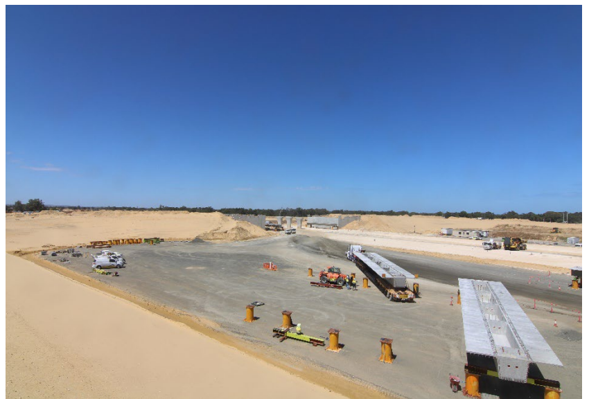
Bridge beams being delivered to the Raymond Road construction site

More to come on these milestones in February.