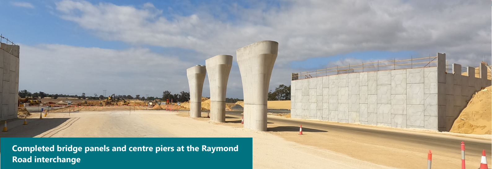
Completed bridge panels and centre piers at the Raymond Road interchange

This update contains information regarding the current and future works happening on the Bunbury Outer Ring Road (BORR) project. Information in this update is current as of January 2023 and is subject to change. For the most recent updates visit the Main Roads BORR website or visit the Bunbury Outer Ring Road Community Facebook Group.