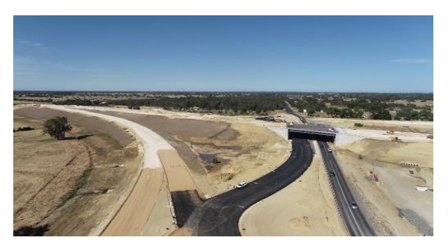
South West Highway (north) interchange

Further along the alignment, at the Boyanup-Picton Road overpass (also known as the Mega-Bridge), installation of all 60 beams has been successfully completed, capping off an intensive 12-month construction process. Concreting activity for the bridge deck slabs is also underway. You can see the progress in the images below,