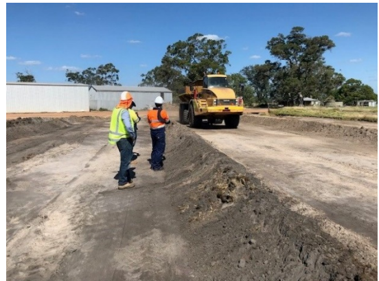
Team members on site at Raymond Road

The team is excited to welcome talented contractors onto the project who understand the area and how important BORR is to the wider community.