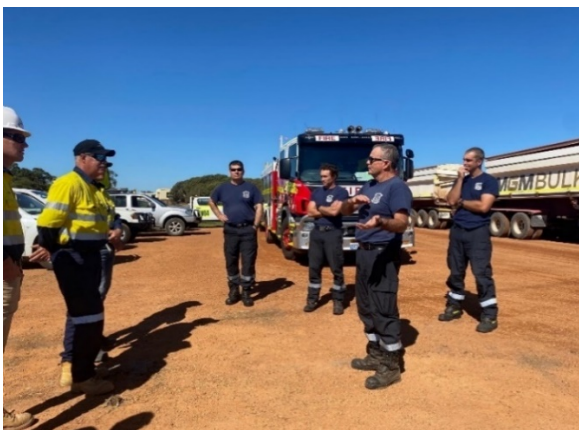
DFES speaking with the central construction team

This was a great result for all involved and we look forward to the next drill with the DFES team.