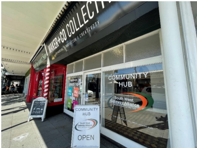
The Community Hub (75 Victoria Street, Bunbury)

Please click here to register for the session. While registration is not essential to attend, please consider doing so as it will help us ensure we can answer as many of your questions as possible on the day.