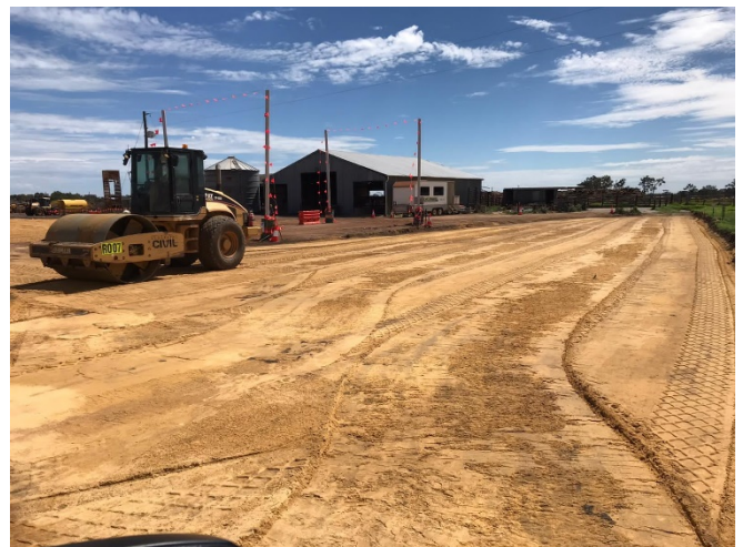
Site works at Raymond Road

For further construction information, you can join our Bunbury Outer Ring Road community group on Facebook or visit our Community Hub at 75 Victoria Street, Bunbury.