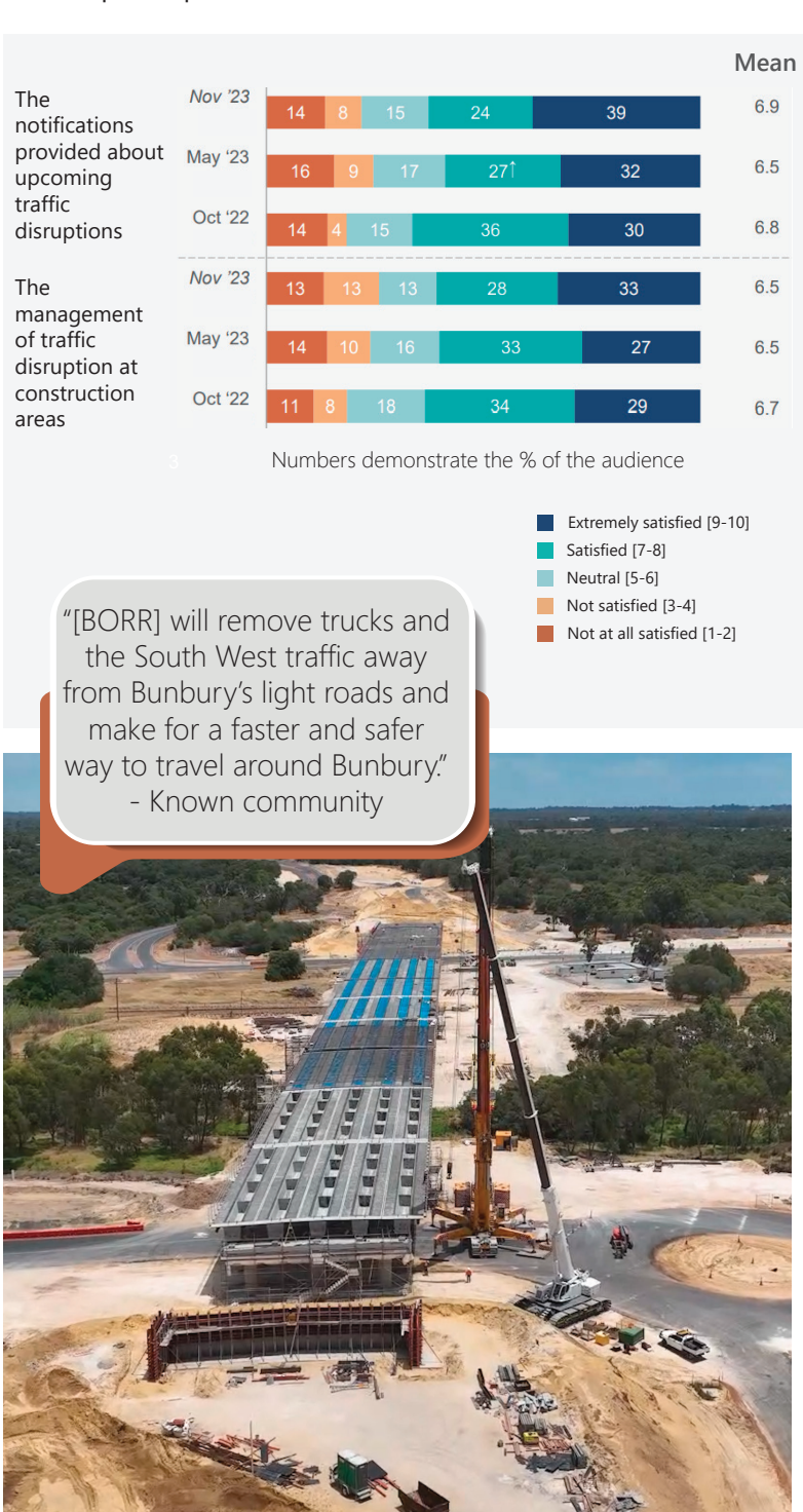
The Golding Crescent and Boyanup-Picton Road overpass bridge