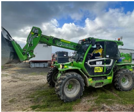
Reef to Range telehandler operator Douglas Nock