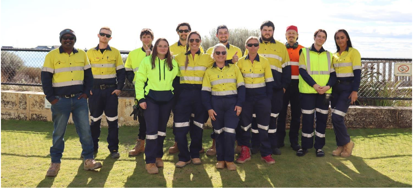
Recent Yaka Dandjoo program graduates