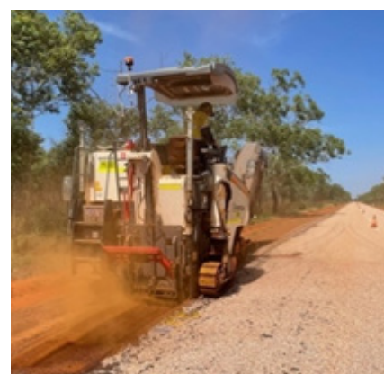
Shoulder widening works, April 2022.

It is planned to complete the sealing of the shoulders up to Ardyaloon in 2023. This work will include improvements to drainage and road batters to improve road safety.