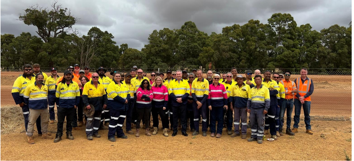
Transport Minister meeting the Garli team during construction

A major focus has been Aboriginal engagement with the project achieving: