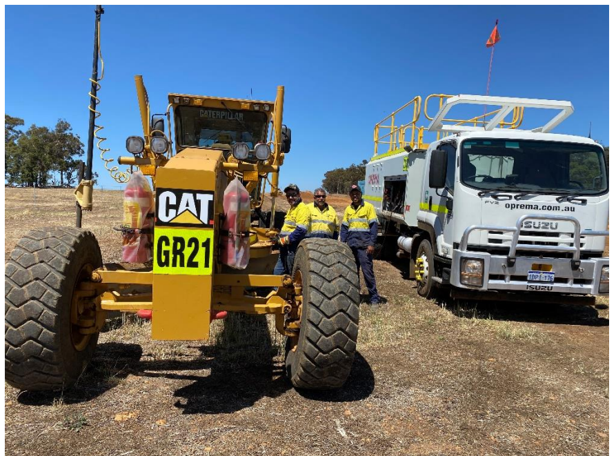
Some of the Garli work crew