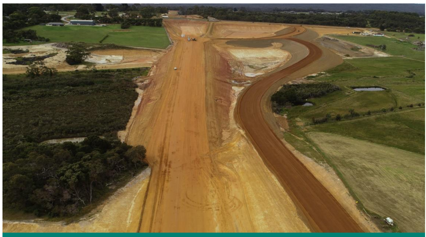
Earthworks at the Albany Ring Road, Link Road and South Coast Highway interchange (looking south towards South Coast Highway)