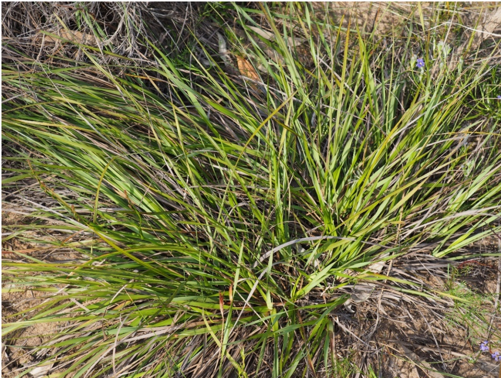
Plate 1: Tetraria australiensis (T) (Woodman 2020)

DBCA data indicates that 66 locations of Tetraria australiensis are known comprising 21,500 individuals (Woodman 2020; DBCA unpublished data). At least three of the populations occur in conservation tenure (Watkins Road Nature Reserve, Lambkin Nature Reserve, Ruabon Nature Reserve) (Woodman 2020).