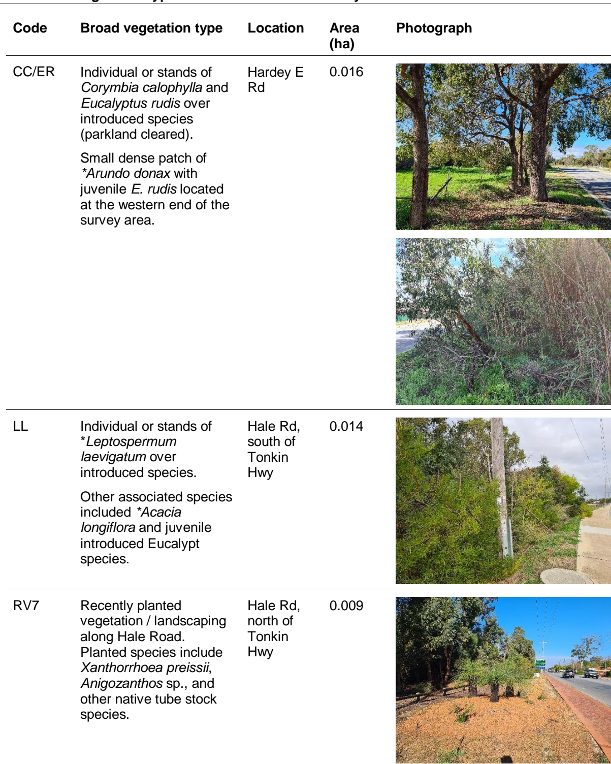
Table 1 Vegetation types identified within the survey area