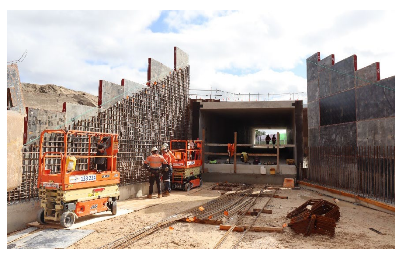
Benara Road underpass

Works have started for the new footbridge over Tonkin Highway in Malaga with clearing and earthworks underway. This month we will start the concrete works for the bridge abutments on both sides of Tonkin Highway and continue the limestone