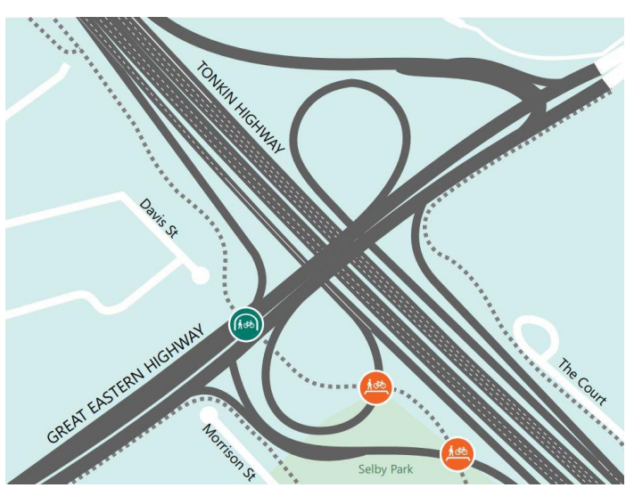
Great Eastern Highway interchange design

During the next few months, you will continue to notice lane reductions on Great Eastern Highway in both directions between Tonkin Highway and Moreing Street. The U-turn travelling eastbound will also remain closed during the works, with the next U-turn at Coolgardie Avenue for commuters that want to travel west. To set up the new traffic configuration we will need to work at night in October.