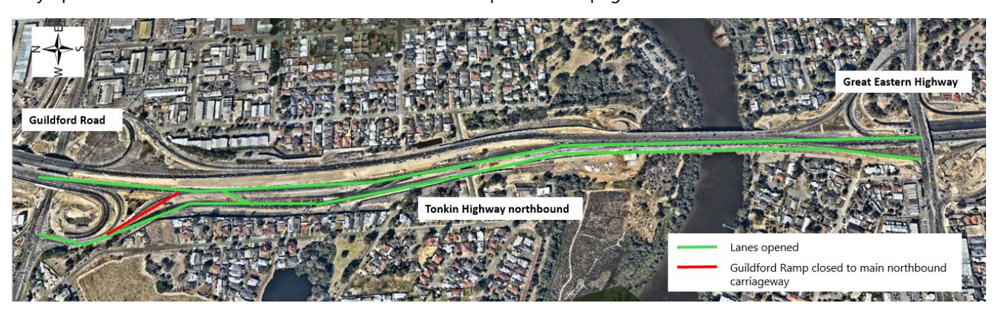
Map 1 Great Eastern Highway works

Pending approval, you will see temporary traffic changes between Great Eastern Highway and Guildford Road from 16 May to mid-June. Traffic entering Tonkin Highway northbound from Great Eastern Highway will be driving on a new section of the Redcliffe Bridge. Once this switch happens, commuters travelling on Tonkin Highway northbound main carriageway will not be able to exit at Guildford Road (map 1). A detour will be in place for northbound traffic who want to exit at Guildford Road. If you are traveling from Great Eastern Highway heading north, access to Guildford Road remains. This is so the team can complete pavement works adjacent to the ramp. Stay up to date on Main Roads website and our Tonkin Gap Facebook page for further information