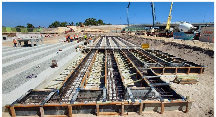
Noranda station car park works

Works on the Benara Road underpass will continue in March. With sheet piling in the median now installed, and traffic switched to the southern side of Benara Road, we will continue earthworks to build the northern half of the underpass.