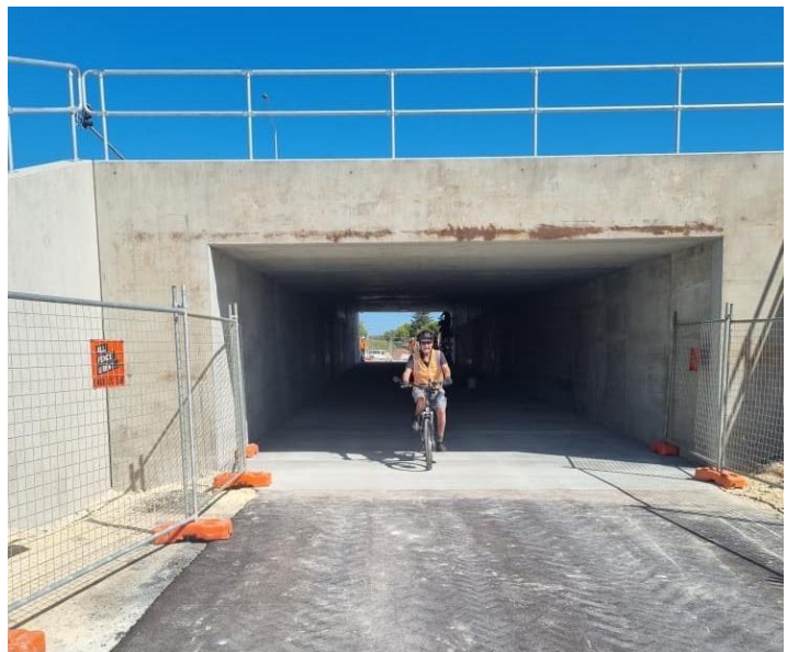
Great Eastern Highway underpass

In late March we will start to build the footings for the new directional signage over Great Eastern Highway. During installation, we will need to close the footpath on Great Eastern Highway eastbound between The Ascot Apartments and Tonkin Highway for approximately two months. There will also be traffic management on Great Eastern Highway when we install signage over the road. Stay up to date on the Tonkin Gap Project 'Roadworks' page on the Main Roads website for details and the detour map.