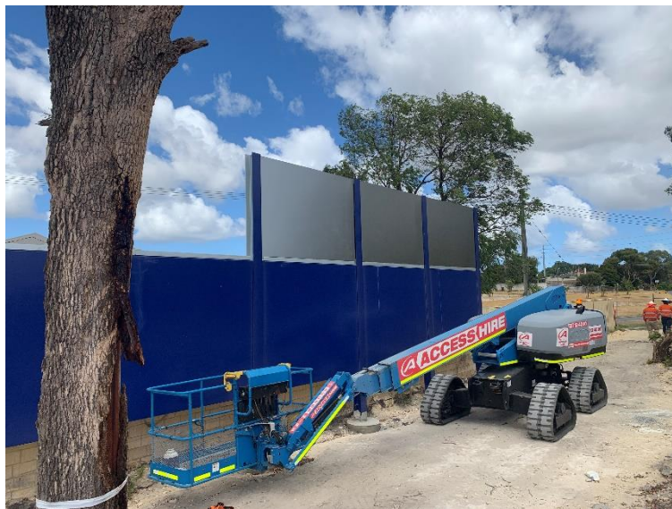
Acrylic panel installation

We will be building an access track so we can install the noise walls next to Selby Park and Greenshields Way, Belmont. We will then be installing the footings and posts. Vibrations may be noticeable while we build the track.