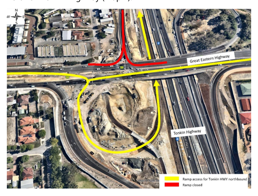
Map 1 - Loop ramp activation

The next stage of the Great Eastern Highway upgrade is about to start. In mid-June we will be activating the new loop ramp from Great Eastern Highway to Tonkin Highway northbound and temporarily closing the existing northbound on-ramp. This means that if you are travelling eastbound on Great Eastern Highway you will turn right onto the loop ramp to head north on Tonkin Highway, and if you are travelling westbound you will turn left to head north on Tonkin Highway (Map 1).