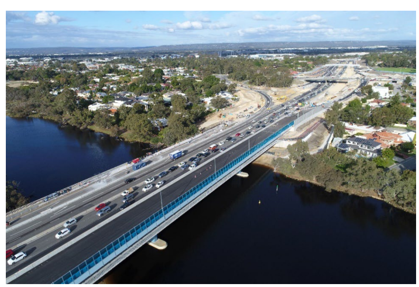
New lanes over Redcliffe Bridge

Pavement works continue for the northbound Collector-Distributor Road (CD road) that runs between Stanton Road and Guildford Road. A CD road separates highway through traffic from other vehicles that are entering or exiting the highway. Asphalt works for the CD road are expected to be complete mid to late-June and once complete, all traffic travelling on Tonkin Highway northbound will be switched onto the new Redcliffe Bridge so the team can start rebuilding the existing northbound lanes. As a part of this traffic switch, Tonkin Highway southbound