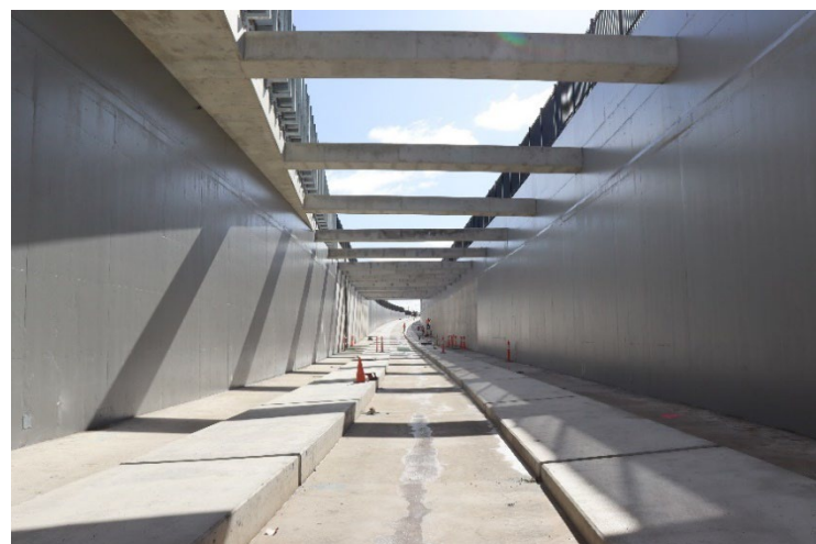
Southern dive structure 2023