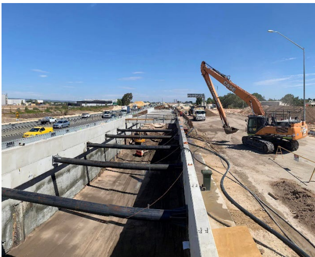
Southern dive structure underway

June was a busy month for the project having checked off some major milestones. Both the northern dive structure and southern dive structure are now ready for their next stage of rail works as part of the METRONET Morley-Ellenbrook Line. Across the two dive structures, 98 diaphragm walls have been constructed, 1,040 secant piles constructed, 39,000 cubic metres of concrete poured, and 65,000 cubic metres of dirt excavated. Works will continue as the METRONET team powers along with the next stage of rail works.