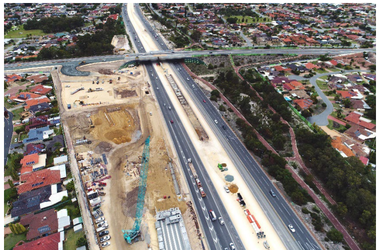
Noranda Station progress

Work to build the southern half of the Benara Road underpass will get underway in July. Traffic will be switched to the northern half of Benara Road in early-July and will remain reduced to one lane in each direction, with speeds reduced to 40km/h until late 2023. Pedestrians will also be switched to travel on the northern side of Benara Road. During this stage, the right turn from Mahogany Road to Benara Road will remain closed. Motorists will need to complete a u-turn to head westbound at the pre-existing u-turn for the duration of these works. To switch traffic, we will close Benara Road between Della Road and Mahogany Road for one night. Further information will be provided via the project website and Facebook page. Works will involve some minor clearing south of Benara Road and excavation. During these works there will be dust, vibrations and noise. We will work to minimise impacts as much as possible.