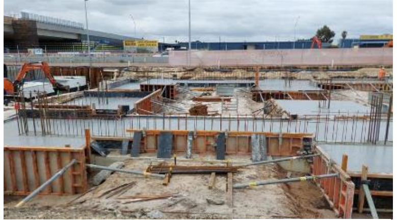
Morley Station carpark footings

Works are continuing at the intersection of Broun Avenue and Embleton Avenue, with the new eastbound lanes on Broun Avenue built. Activity at the intersection will be intermittent in July ahead of works to relocate parts of the Western Power network to complete the upgrade. The right turn from Broun Avenue eastbound, and right turn from Broun Avenue westbound are currently closed. Traffic is currently on a temporary alignment with lane closures in place, as required.