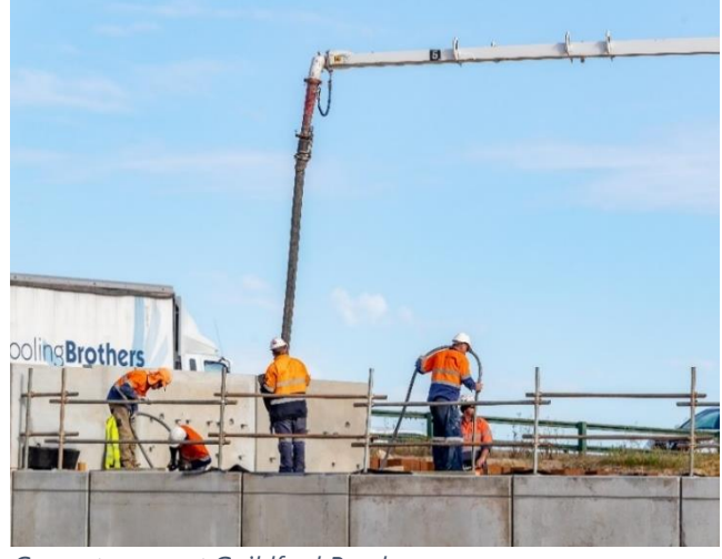
Concrete pour at Guildford Road

Intermittent lane closures will be required on Railway Parade and Guildford Road, while we finish building the bridge deck and remove the temporary bridge protection. This work will be completed at night. To keep up-to-date on all upcoming roadworks, visit <a href="https://www.mainroads.wa.gov.au/tonkin-gap/#roadworks">https://www.mainroads.wa.gov.au/tonkin-gap/#roadworks</a>