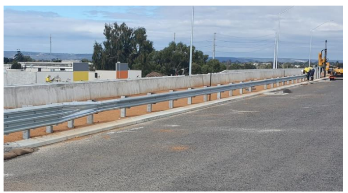
Steel traffic barriers installed along the project

During July, we will be working at night to install permanent steel traffic barriers between Railway Parade and Dunstone Road. A piling and drill rig will be required to install steel posts into the ground to support the barriers. During this work, there will be noise and vibrations.