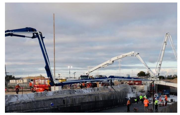
Early morning concrete pour at the northern dive

In January our crews will be working out of hours (7pm until 7am) in our project area and along Tonkin Highway between Dunreath Drive and Hepburn Avenue. Dates are subject to change and specific details will be communicated on the Facebook page and Main Roads WA website.