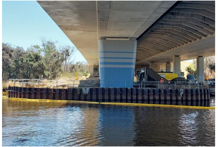
Cofferdam removal at Redcliffe Bridge

This month there will be intermittent stop/slow traffic management and nightworks on Dunstone Road. This will allow the team to complete works on the existing bridge traffic barriers and paint the noise walls on the bridges. Pending approval, there will also be a contraflow traffic arrangement put in place for two day shifts in February. This is so we can install the permanent traffic barriers. Stay up to date on the 'Roadworks' page on the Main Roads website and the Tonkin Gap Facebook page for details.