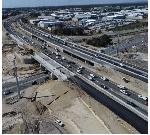
Guildford Road bridges

From 9pm Friday, 9 December to 5am Monday, 12 December the Moojebing rail crossing will be closed so we can remove the existing bridge screens on the old Railway Parade bridge and install drainage along the rail. To safely complete these works over the train line, the Midland Line will also be closed. Train replacement bus services will operate while train services are cancelled. For more details, including the closure times and operation of train replacement services, visit transperth.wa.gov.au.