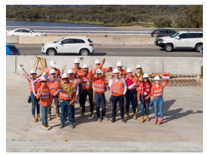
Happy holidays from the Tonkin Gap Project

We understand December is a special time for many which is why we will be pausing construction from 1pm 23 December to 7am 9 January for a holiday break. During the break the Main Roads Customer Information Centre will still be available for urgent enquiries – 138 138.