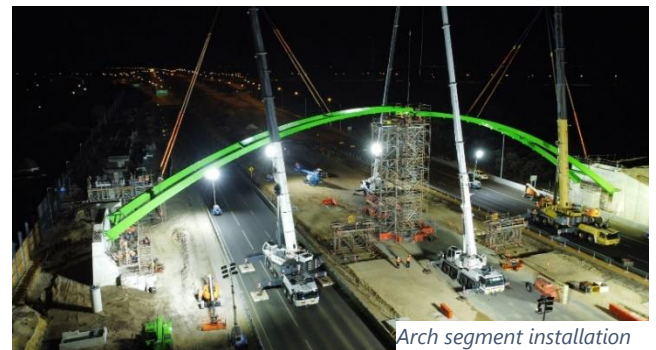
Arch segment installation

Last month we successfully installed the arch segments for the Malaga footbridge over Tonkin Highway as part of the METRONET Morley-Ellenbrook Line works. This month we will be closing Tonkin Highway again to install the remaining bridge deck modules (details below).